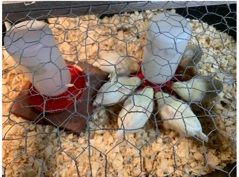
Above: Growing at the VB Farmers Market