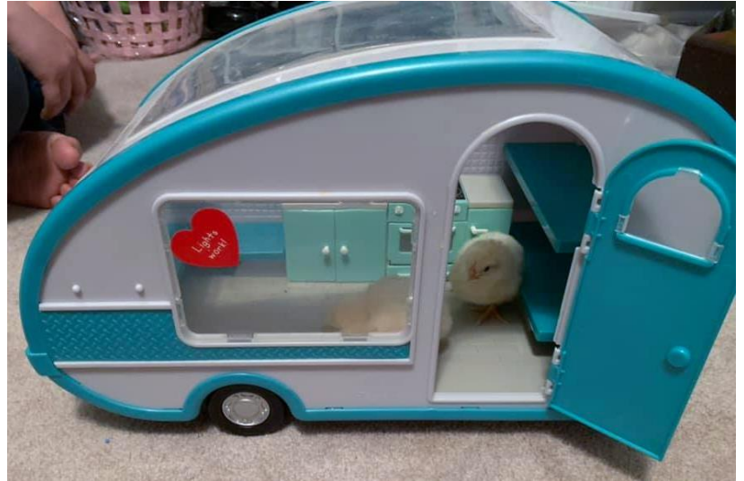
Above: Camping chicks with Barefoot kids.