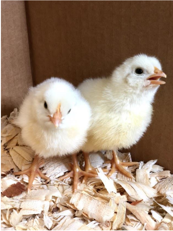
Above: Chicks return to 4-H Office on last day of project